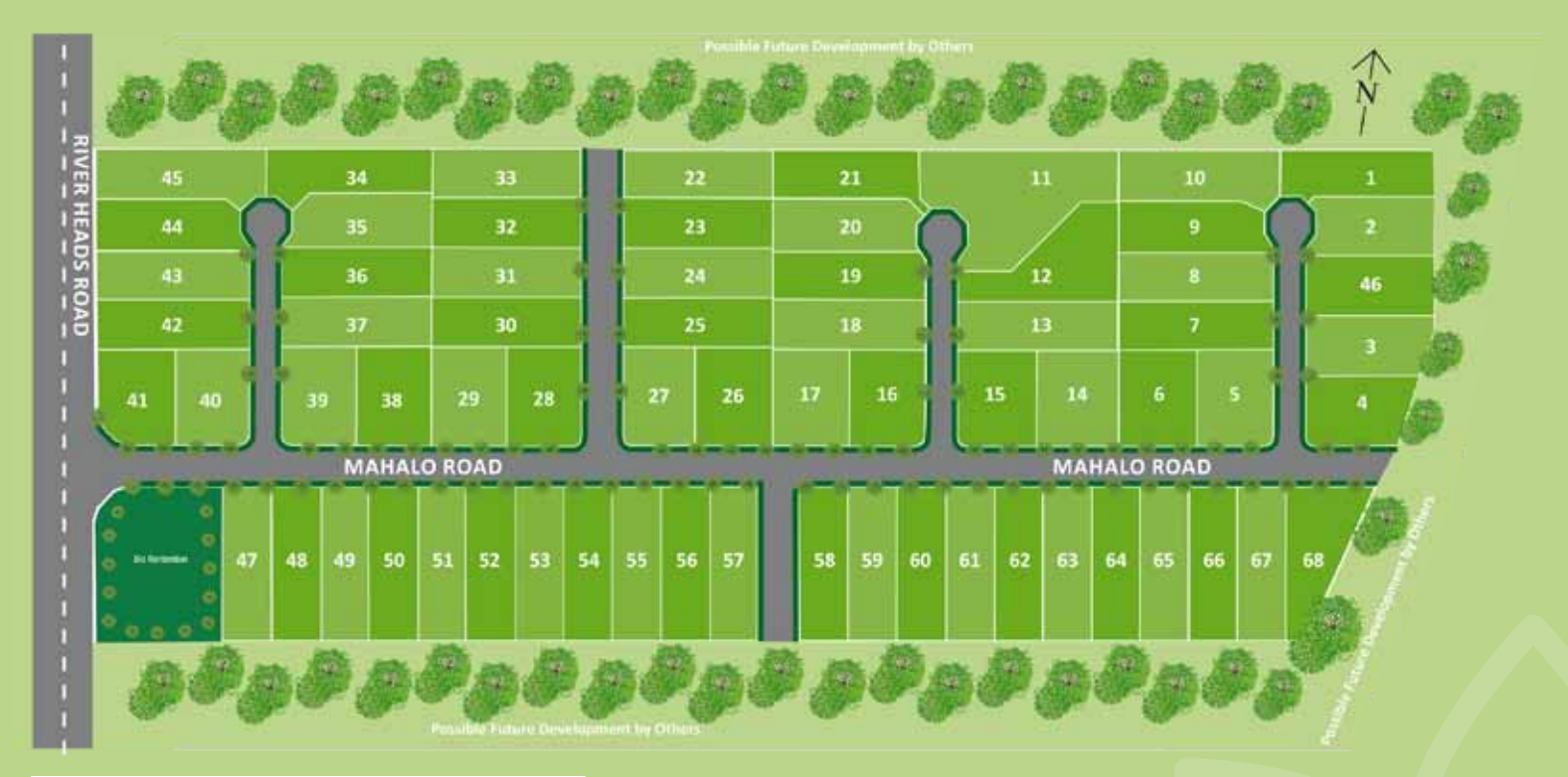
Relax and enjoy the semi-rural outlook